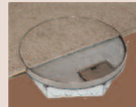
Standard finish stainless steel, shown 7RLR retro