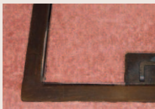
Antique Bronze finish available Note it is a surface finish only

† We recommend a recess of 30mm or less due to the weight of the lid when filled