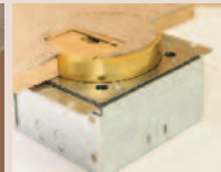
Standard finish brass, shown 7RS square base